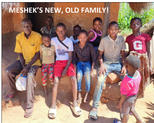
MESHEK'S NEW, OLD FAMILY!